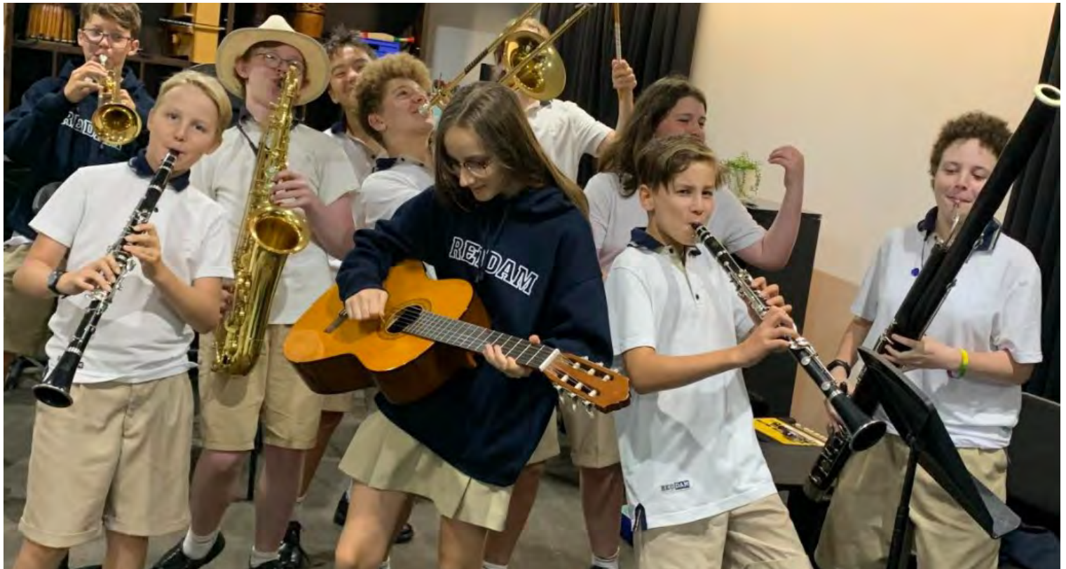
Beauty and the Beast 2021: Rehearsal Schedule Week 4 (February 15-21)

music.secretary@reddamhouse.com.au to enquire.