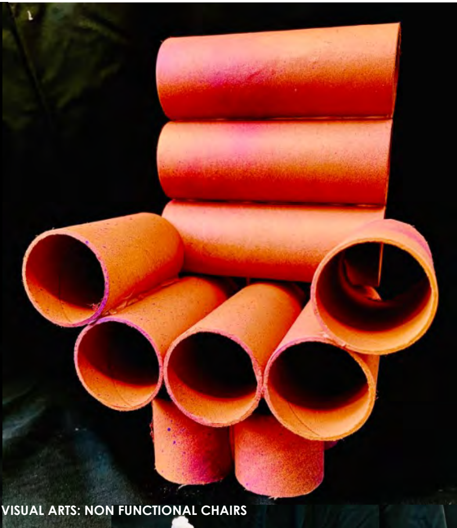
YEAR 11 VISUAL ARTS: NON FUNCTIONAL CHAIRS