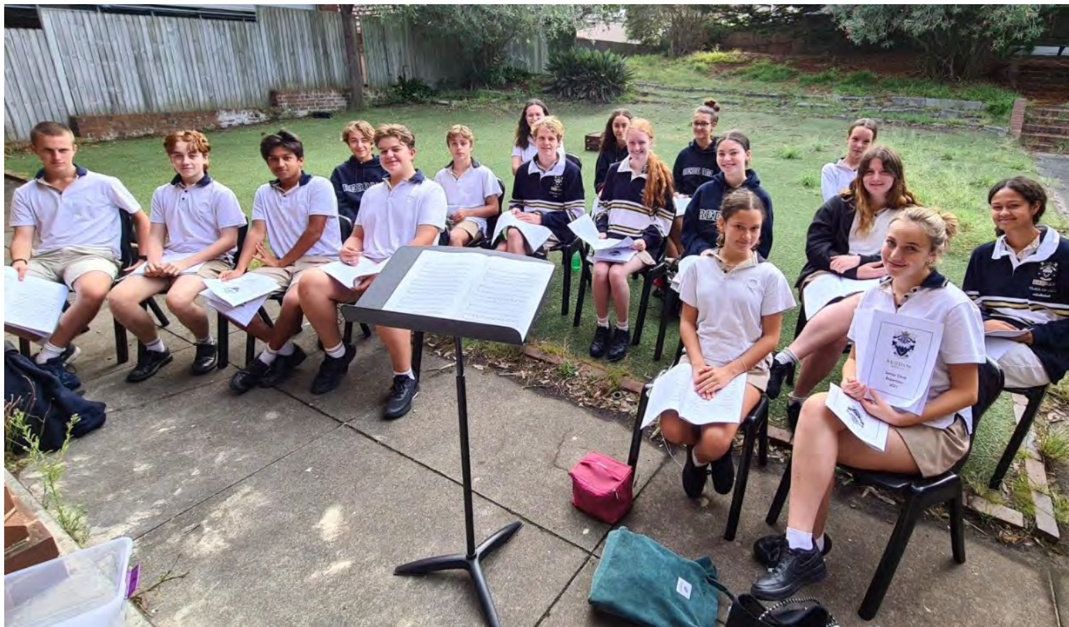
Beauty and the Beast 2021: Rehearsal Schedule Week 5 (February 22-28)

Please enjoy this photo of some of our Bondi Singers, who are enjoying their al fresco rehearsals at the Bondi Learning Centre until indoor rehearsals are once again permitted.