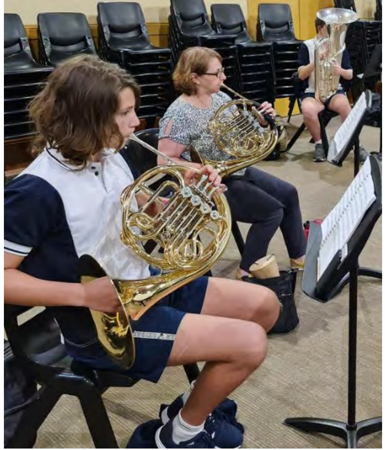
Beauty and the Beast 2021: Rehearsal Schedule Week 6 (March 1-8)